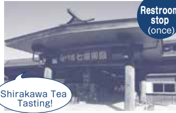
Drive-In Hichiso Goten A full line-up of Gifu's specialty goods