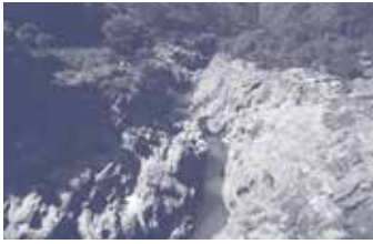
Hisui Gorge (National Natural Monument) Spectacular sight of the narrow gorge formation of rock and deep water

The road to Gero Onsen passes along the Hida River alongside mountains. A two-and-a-half-hour bus ride enjoying the fabulous view of Hisui Gorge and Nakayama Shichiri will enhance your delight for a "healing journey" to the famous hot spa Gero Onsen.