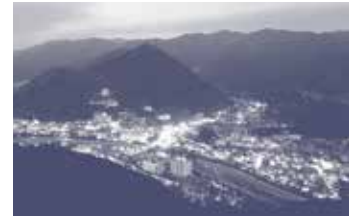
Gero Onsen One of Japan's three famous hot springs along with Kusatsu and Arima