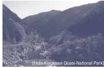
Nakayama Shichiri Gorge Selected as one of the 33 Autumn Leave Sites of Hida-Mino